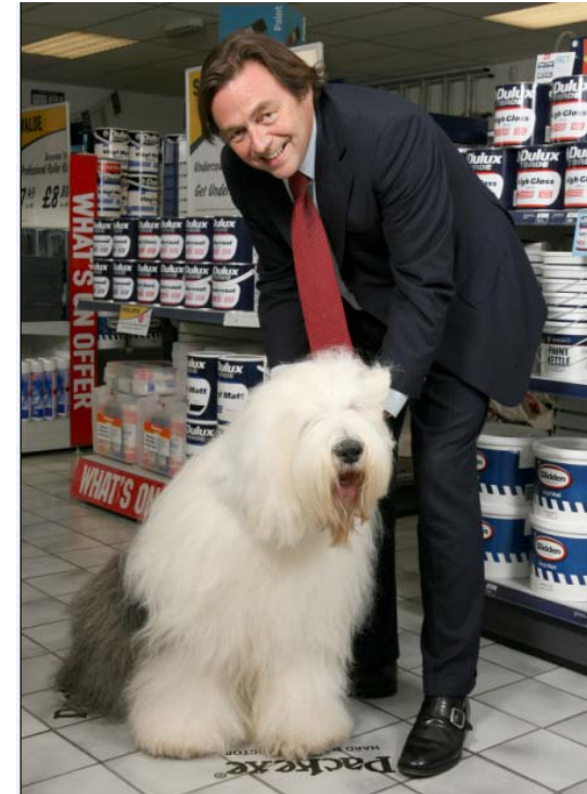
Taking care of the Dulux dog, UK